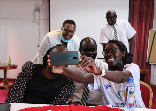
Staff sharing a fun moment with some of the stakeholders in the 'A' Summit.